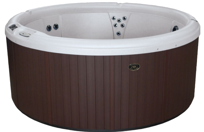
Shell: White | Cabinet: Mahogany